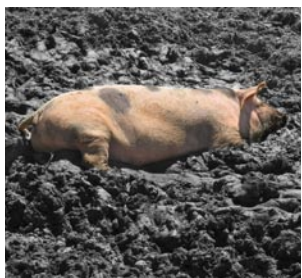
Bacon in the sun