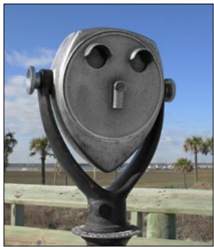
You're the best human being on the horizon