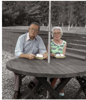
Without ice cream, there would be darkness and chaos