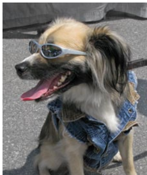
I'm re-doing my Facebook Profile