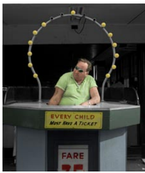
Many good sockets... Few good bulbs