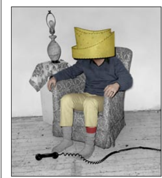
I'm keeping my bright ideas to myself