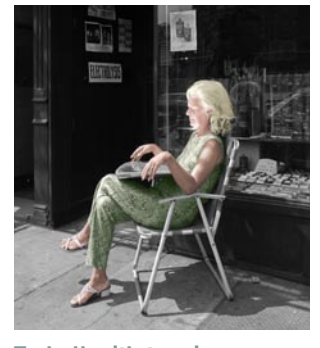
To hell with tanning spas... I'm going solar!