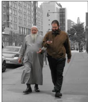
If that's God again, tell him I'm on my lunch break