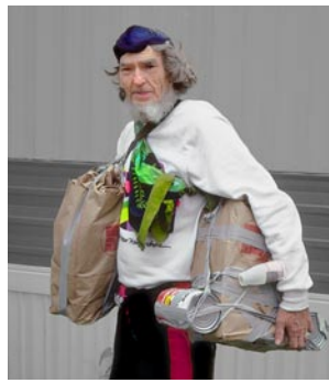
Do not despair We were made for these times