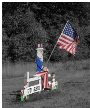
Will work for Food